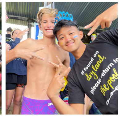
A message from the Malawi Aquatic Union