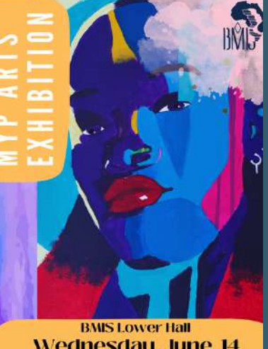
Wednesday, June 14 Art. Exhibition 6-7pm Musical performances 7-8:30pm ash Bari - Food on sale by The Farmers Daughter