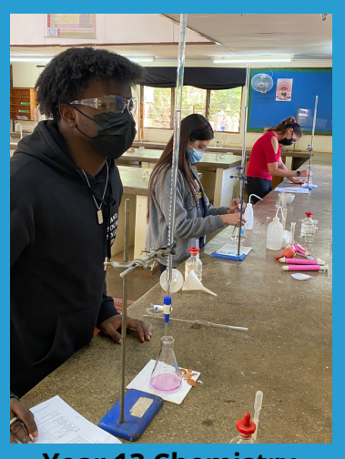
Year 13 Chemistry