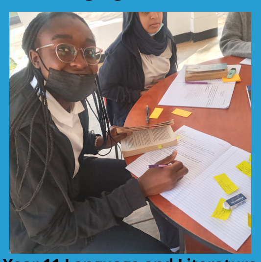
Year 11 Language and Literature