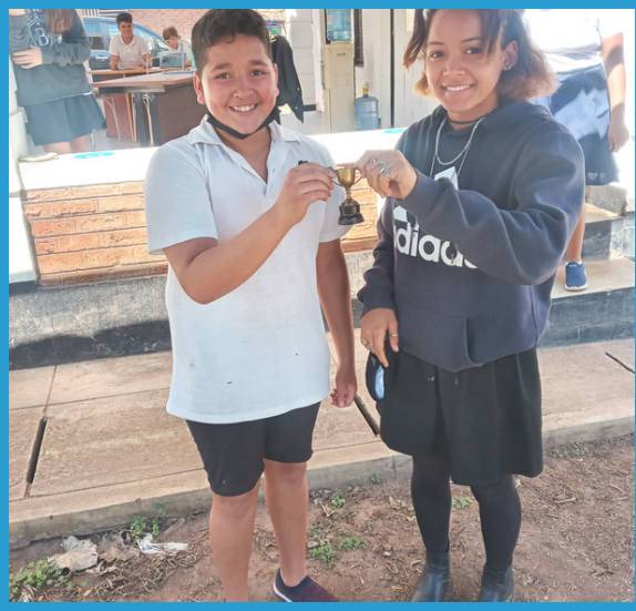
Year 9 Language and Literature