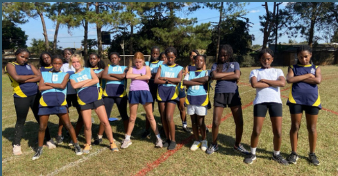
21-4 to BMIS Netball with Attitude!